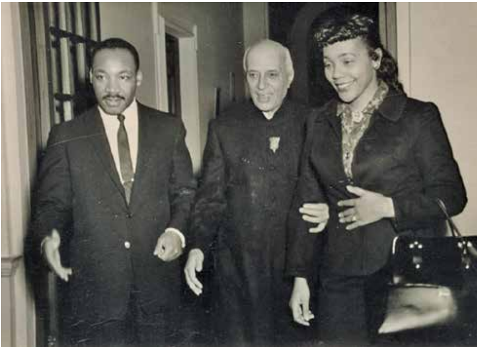
Mr. and Mrs. King with India's First Prime Minister, Jawaharlal Nehru, 1959

In 1959, following Dr. Martin Luther King Jr.'s month-long maiden voyage to India, Ebony Magazine published an eight page account of Dr. King's experiences while in India. In it, King notes his surprise at the Indian media's coverage of the civil rights movement in the United States, laments India's pervasive economic inequalities, applauds India's progress in supporting the Dalit community, and calls upon the West to aid India's development "...in a spirit of international brotherhood." 1 Some would argue that Dr. King's voyage marked a strategic shift in his thinking about the role non-violent resistance would play in the struggle for civil rights in America.